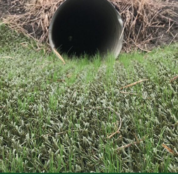
ShearForce12 with new vegetation growth protecting pipe outfall.